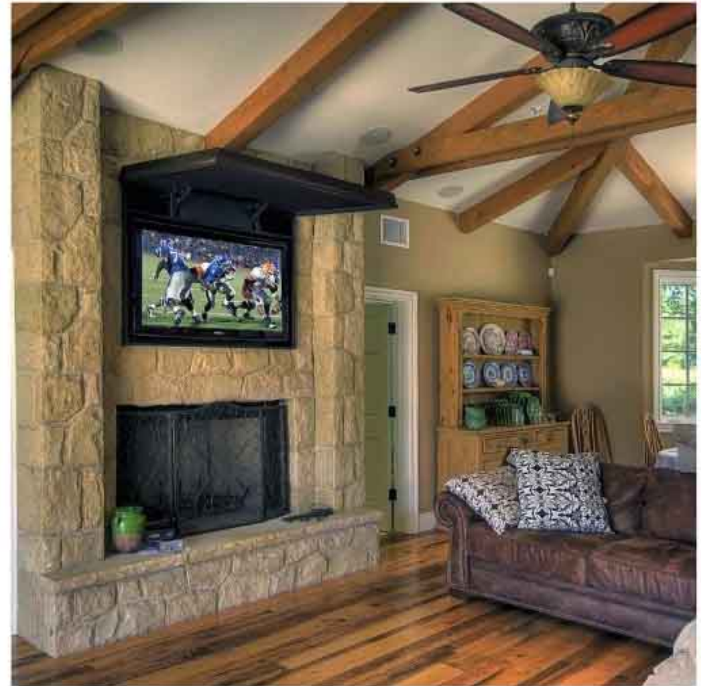
HIDDEN TV - TILTING ART LIFT SHOWN IN UP POSITION

Careful planning was required during construction to properly recess the TV into the stonework surrounding the fireplace.