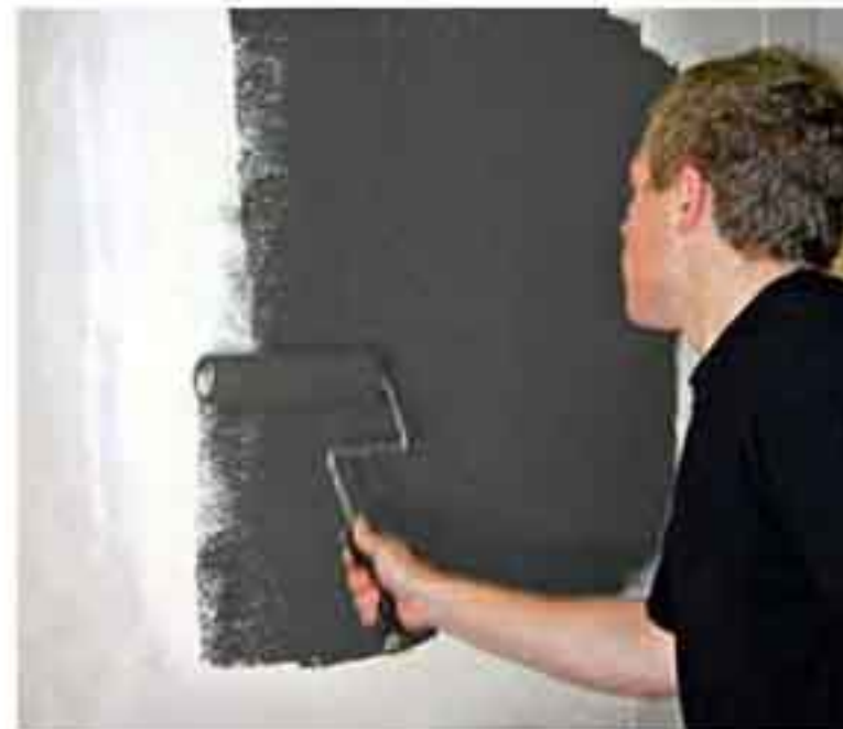
Paint to match