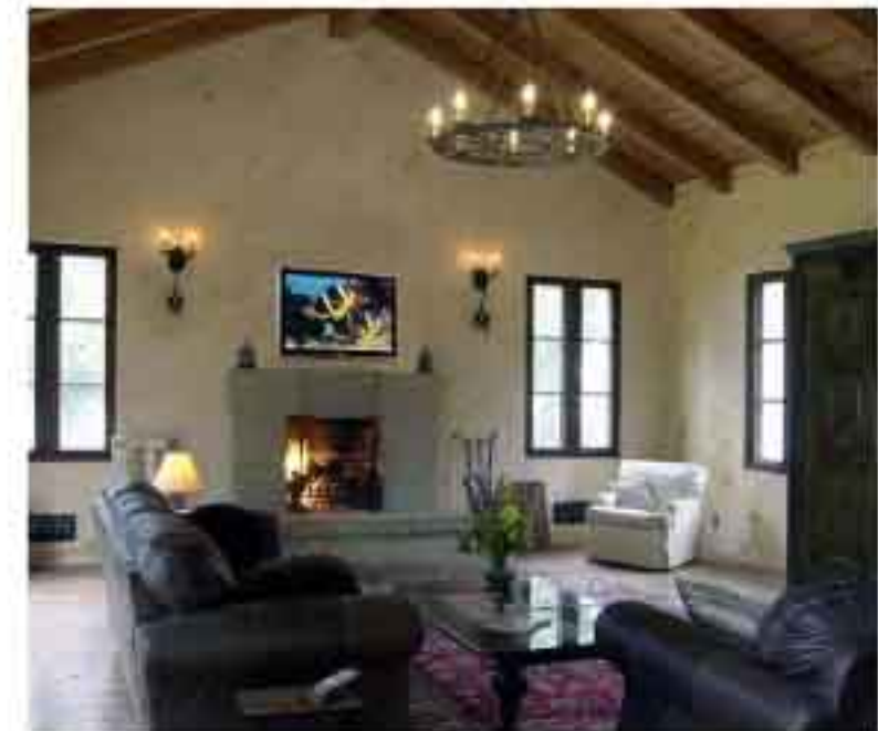
No visible speakers!