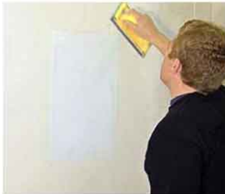
Sand to blend with wall