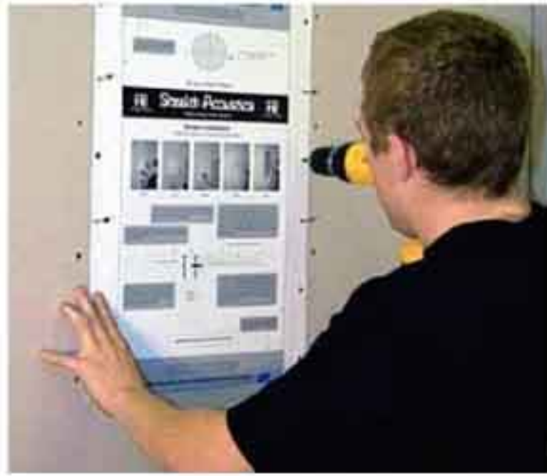
Secure speaker to wall

Invisible speakers are available and can be installed to create great sound from speakers that you can't see. These speakers are built into the wall as shown in the steps below. Once installed these speakers can be concealed with paint, wall paper, or even hidden behind thin wood veneer