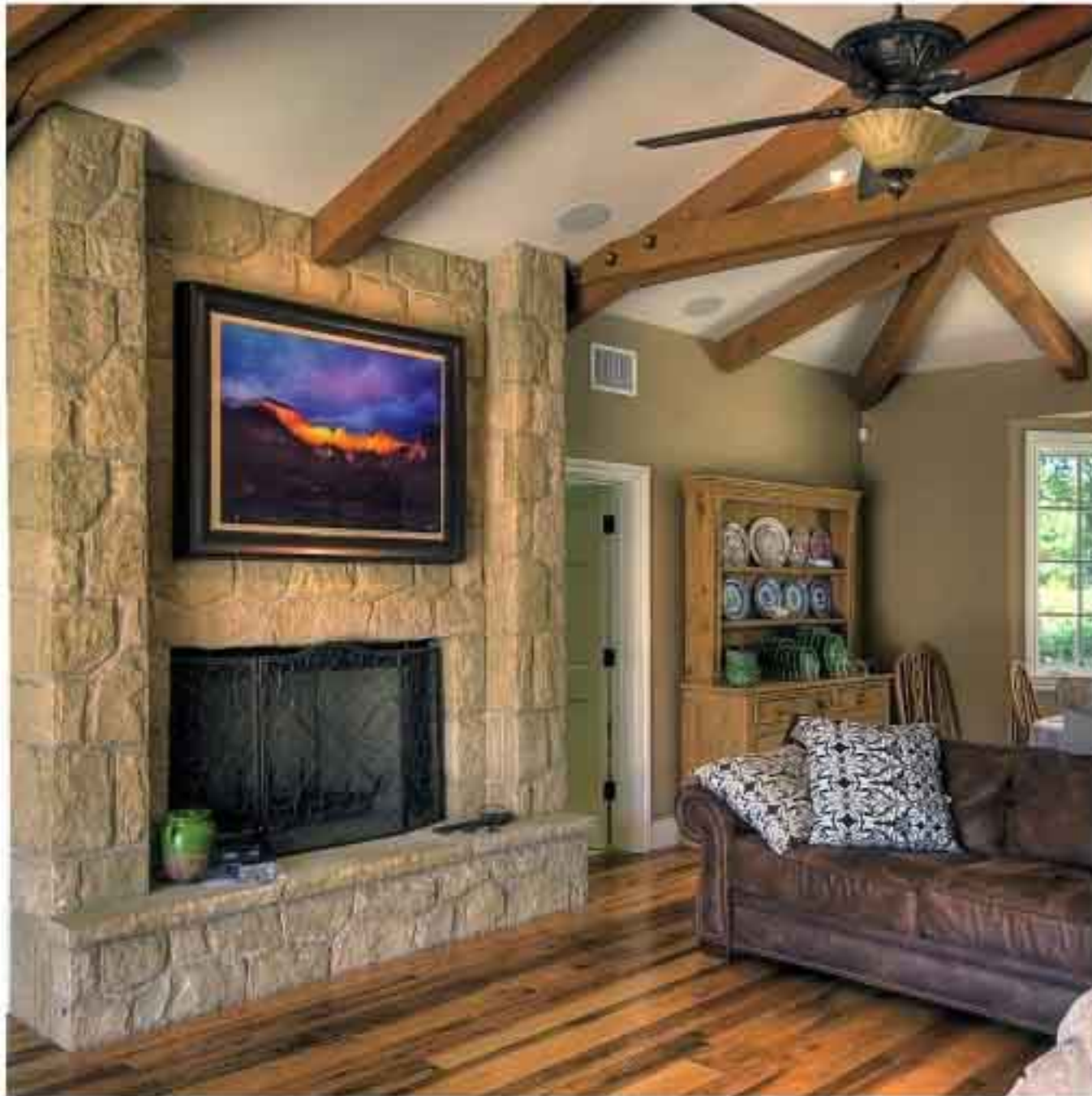
HIDDEN TV - TILTING ART LIFT SHOWN IN DOWN POSITION

This installation utilizes a tilting mechanism to conceal a flat panel TV behind original artwork. A single button press on the remote control raises the art, turns on the TV and dims the lights.