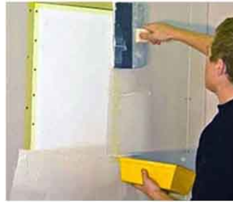
Tape & feather joint compound